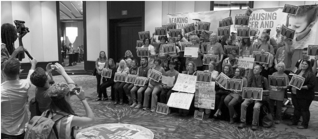
Some of the collaborative organizations gathered at a press conference/rally in support of the various testimony around the EPA regs...